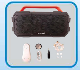
eKoure + Transmitter + Speaker Package