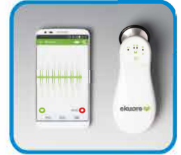
eKoure with Phone

Accompanying Software Name: eKoure Pro App available for iOS and Android Devices