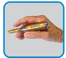
Cartridge with Pro-Body & Spray Tip