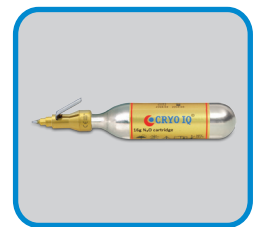
25 Gram Cartridge