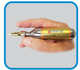
Cartridge with Derm-Plus Spray Tip